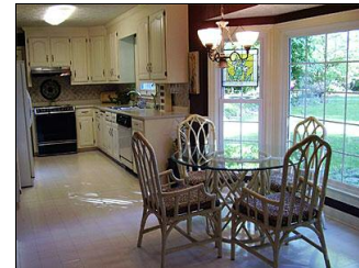
Breakfast area & kitchen