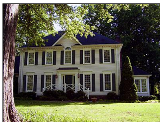
Westchester Way front