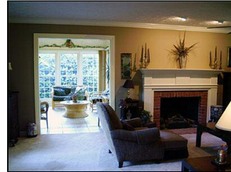
Living room & Florida room