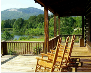
Table Rock State Park